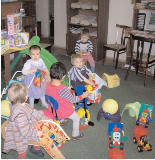
The children at the Pechory Original Children's Orphanage try out some of their new toys