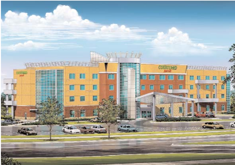
Courtyard by Marriott Arbor Lakes