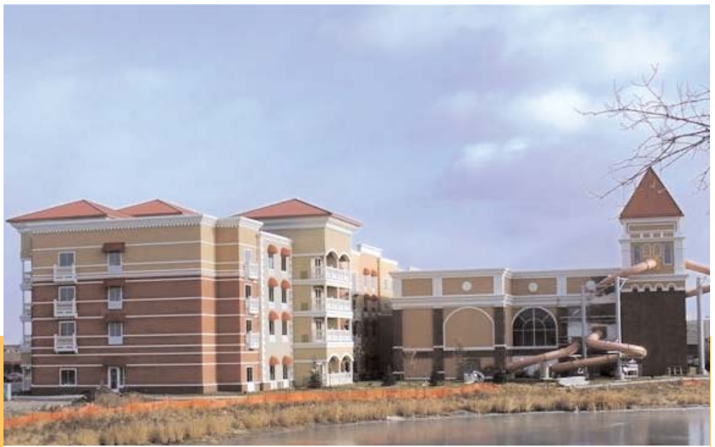
The much anticipated Holiday Inn Hotel & Suites and Venetian indoor water park opened on January 30th, 2007 at the corner of I-694 and Hemlock Lane in Maple Grove, Minnesota.

...continued on page 13 Holiday Inn & Suites of Arbor Lakes