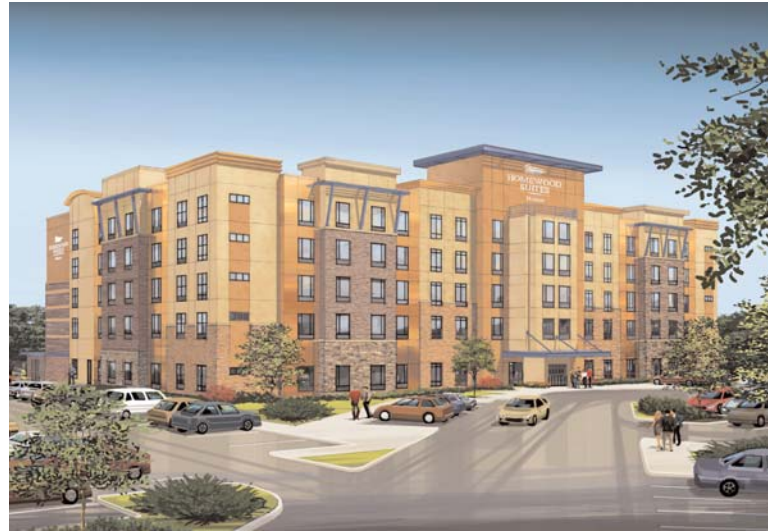
Homewood Suites St. Louis Park

Two new TPI hotel projects are in varying stages of development. The construction phase of the Courtyard Arbor Lakes (above left) is well under way. This 118-room hotel will sport some of the latest high-tech amenities in the hospitality industry. From the LCD TVs to the year around outdoor hot tub, the Courtyard by Marriott at Arbor Lakes promises to provide an unmatched lodging experience. Plans call for an opening in early 2008.